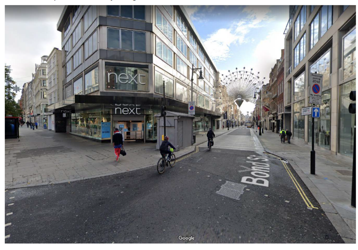
The reason for the de-designation

Pitch 1717 New Bond Street is located on New Bond Street east footway, 4' 6" from pedestrian cross push button pole, 18" from kerb edge. The following image is a photograph of where the pitch is currently designated: