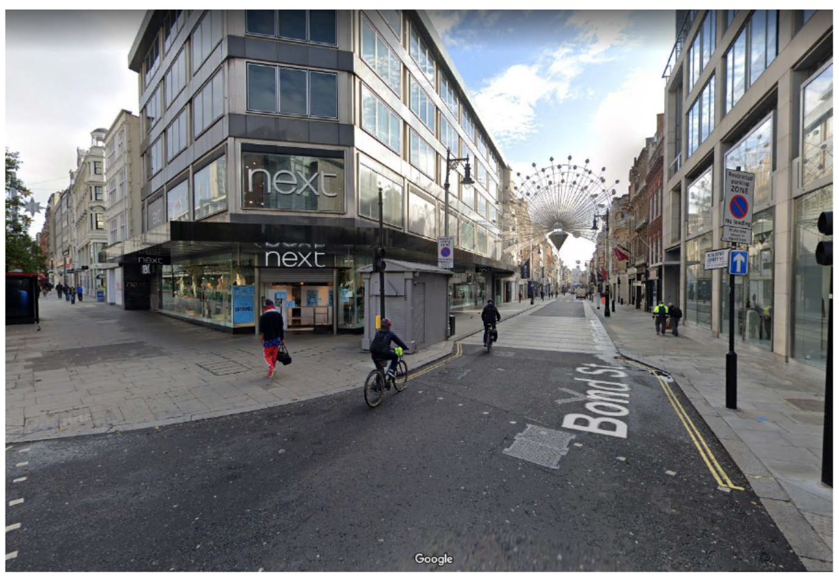
The reason for the de-designation

Pitch 1717 New Bond Street is located on New Bond Street east footway, 4' 6" from pedestrian cross push button pole, 18" from kerb edge. The following image is a photograph of where the pitch is currently designated: