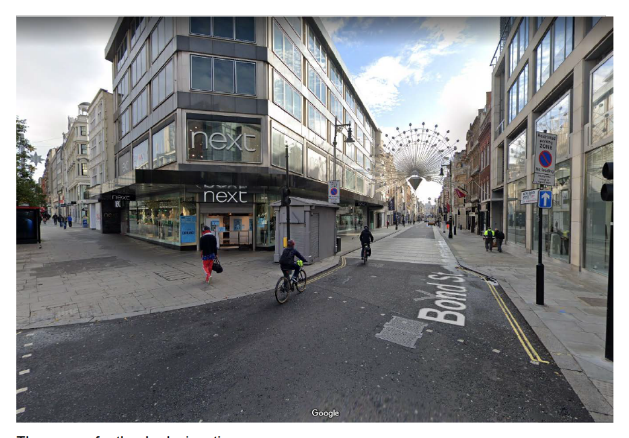
The reason for the de-designation

Pitch 1717 New Bond Street is located on New Bond Street east footway, 4' 6" from pedestrian cross push button pole, 18" from kerb edge. The following image is a photograph of where the pitch is currently designated: